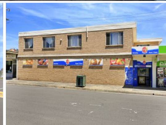
Shop 1a, 2-4 Kelly Street BERKELEY, NSW