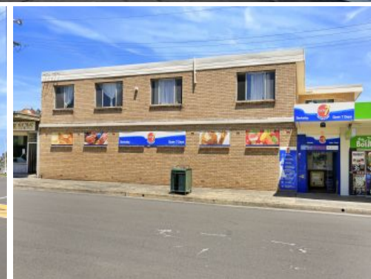
Shop 1, 2-4 Kelly Street BERKELEY, NSW